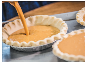
Pouring of pumpkin pie batter.