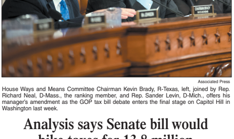
Analysis says Senate bill would hike taxes for 13.8 million