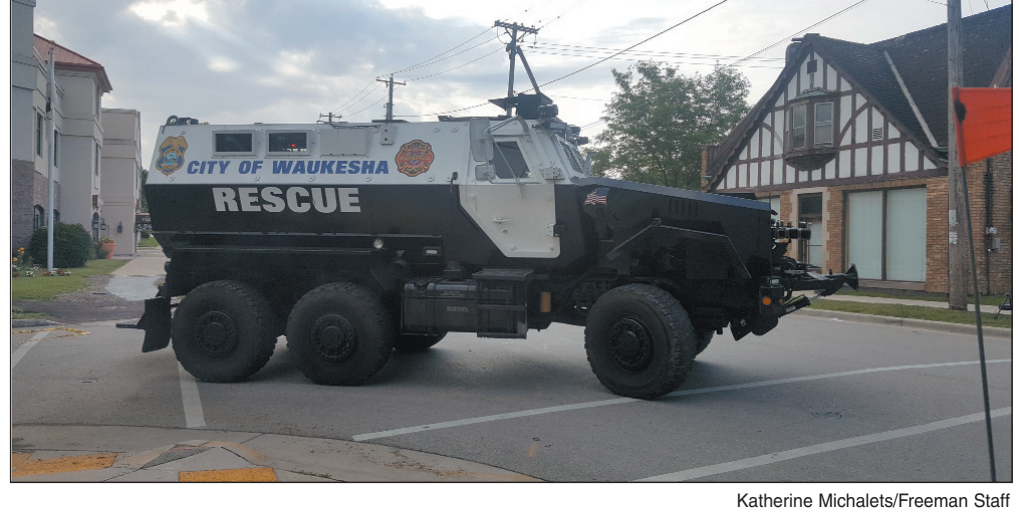
The Waukesha Police Department rescue vehicle leaves the scene of a domestic dispute incident on Caroline Street on Friday morning.